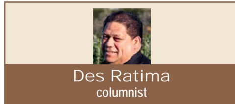
Des Ratima columnist

Let me illustrate my point with two examples.